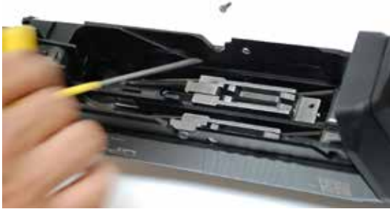
Figure E-1: Align the cutout