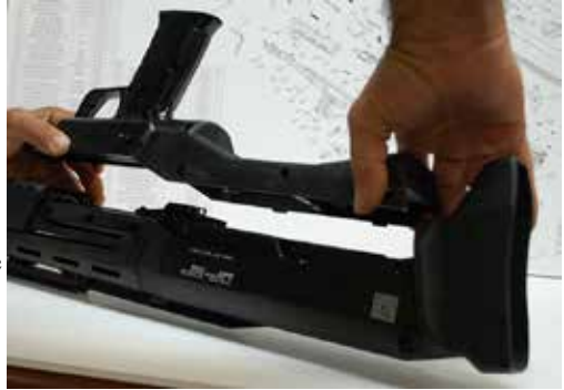
Figure D-8: Pull rear away from aluminum action.

7. It is best to slide the forend assembly forward. Begin removing the assembly by rocking the front of the grip assembly away from the magazine tubes slightly. Then slide the grip assembly away at an angle parallel to the rear of the receiver. Return screws and pin to their original locations. See Figure D-7 and D-8.