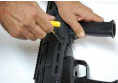
Figure D-5: Loosen and remove screws