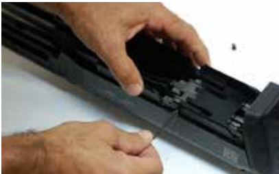
Figure D-9: Remove socket screws (both sides)

1. With the grip assembly removed the bolt retainer plate may be removed to access the bolt sled and bolts. Remove the flat head socket screws on each side (See Figure D-9) of the receiver to the rear of the irregular “U” shaped notch in the receiver bottom. Slide the black anodized bolt retainer plate approximately 1/4” forward so that its rear corners are free from the notches in the sides of the receiver. Lift directly up and out of the receiver. See Figure D-10.