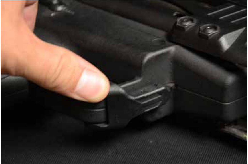
Figure C-2: Action bar release

CAUTION: DO NOT HOLD THE FOREND BEHIND THE PICATINNY RAIL. DOING SO WILL SHORT STROKE THE ACTION AND PINCH YOUR HAND.