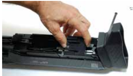
Figure D-10: Slide the retainer plate forward and lift up and out.

2. The bolt and bolt sled should now be resting in the receiver of the DP-12 and can be removed by reaching in and lifting out the bolt sled as shown in Figure D-11.