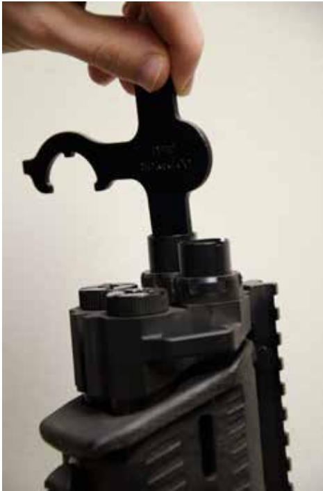
Figure F-1: Turn counter clockwise to remove choke tubes.