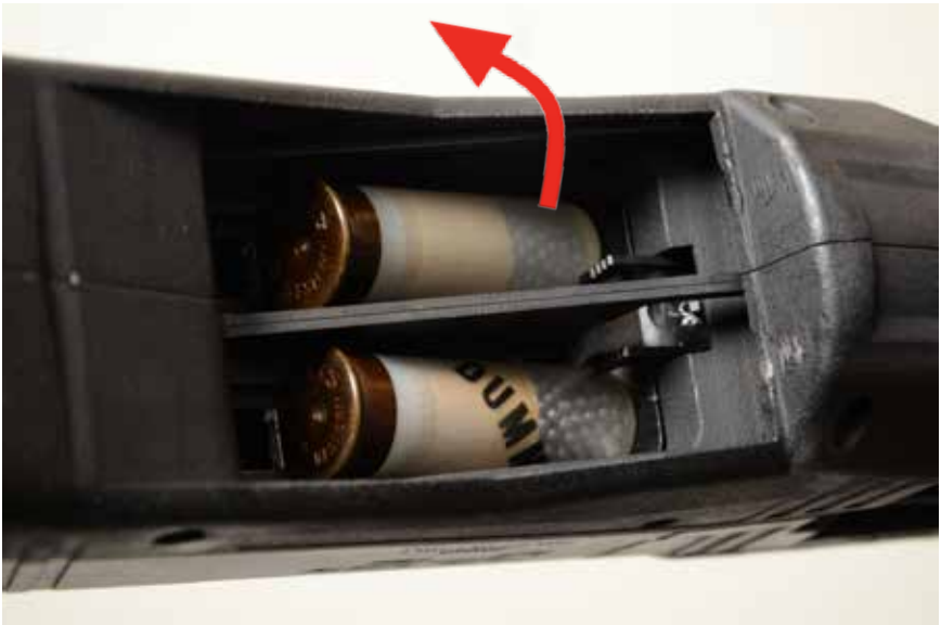
Figure F-1: Clear Double Feed by Rotating Shell Around Lifters

Otherwise, you must manually reach into the ejection port and remove the interfering shell by rotating it around the shell lifters as shown below.