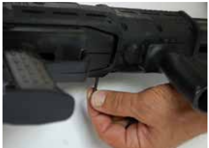
Figure D-6: Remove screws