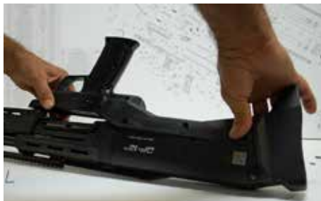
Figure D-7: Remove grip assembly