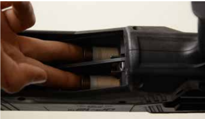
Figure C-1: Loading Shells into the Magazine Tubes

Magazines can be filled simultaneously by using two fingers while the firearm is stable upside down and pointed in a safe direction.