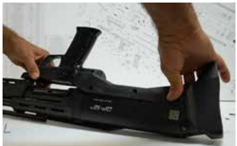
Figure D-7: Remove grip assembly