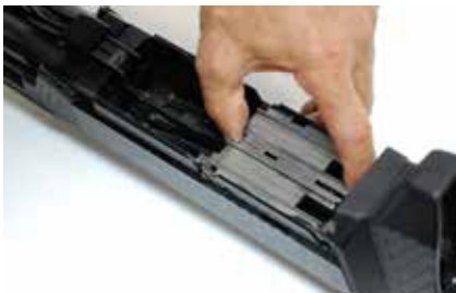
Figure E-2: Lower the bolt sled