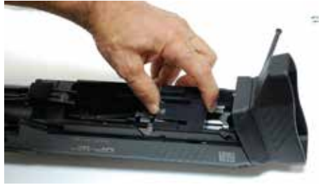
Figure E-4: Slide the bolt retainer plate down through the cutout

Move the bolt retaining plate down and then rearward so that the rear outside corners enter the 1/8” horizontal slots in the receiver sides. The threaded holes should then align with the counter sink holes in the sides of the receiver. Install the #5-40 flat head screws in each side. See Figure E-5