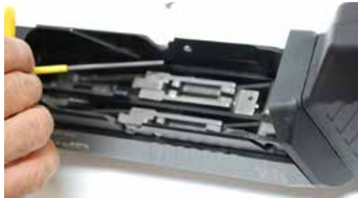
Figure D-13: Remove Exposed Bolt from Receiver Note that the slidearm bumps are in their notches in the bolt sled.

CAUTION: FURTHER DISASSEMBLY SHOULD ONLY BE PERFORMED BY A CERTIFIED GUNSMITH OR STANDARD MFG. ATTEMPTING FURTHER DISASSEMBLY COULD VOID YOUR WARRANTY.