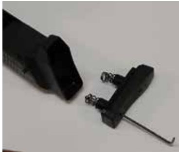
Figure D-1: Removal of recoil pad assembly