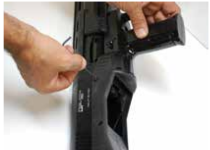
Figure D-4: Remove socket screws