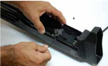
Figure E-5: Install the flat head screws.

Move the bolt retaining plate down and then rearward so that the rear outside corners enter the 1/8” horizontal slots in the receiver sides. The threaded holes should then align with the counter sink holes in the sides of the receiver. Install the #5-40 flat head screws in each side. See Figure E-5