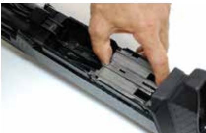
Figure E-2: Lower the bolt sled