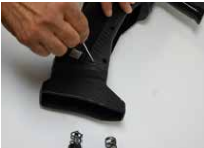
Figure D-3: Removal of rear assembly pin