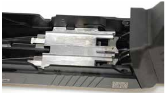
Figure D-11: The bolt and bolt sled resting in the receiver.

2. The bolt and bolt sled should now be resting in the receiver of the DP-12 and can be removed by reaching in and lifting out the bolt sled as shown in Figure D-11.