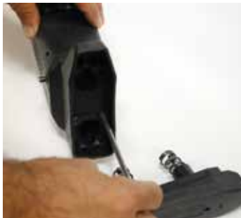
Figure D-2: Loosening of socket head cap screws